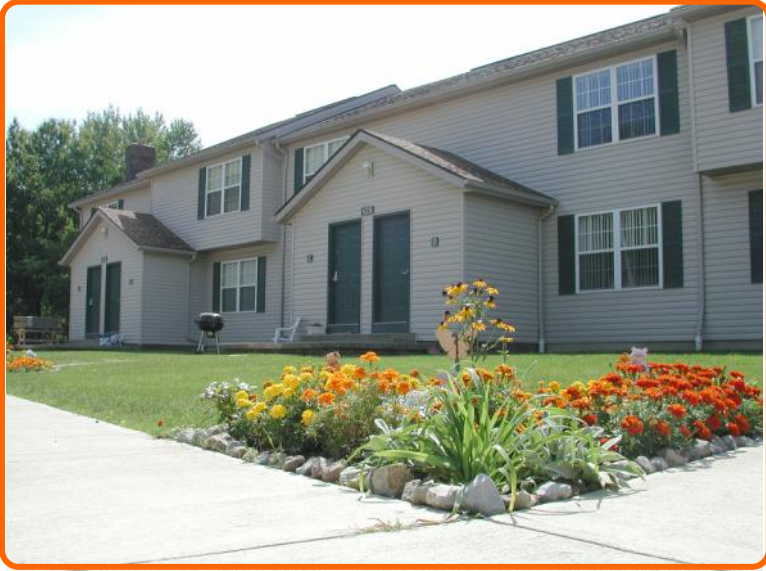
Transitional and Permanent Housing: Peachtree Estates

OMCDC's transitional housing programs allow residents rent subsidy for up to two years while tenants reintegrate into an independent lifestyle. Rent is determined on an individual basis and, in some cases, a portion is saved on the tenant's behalf and returned back to them at the end of the program.